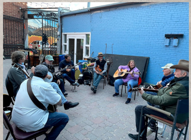
Look around, listen and pick!