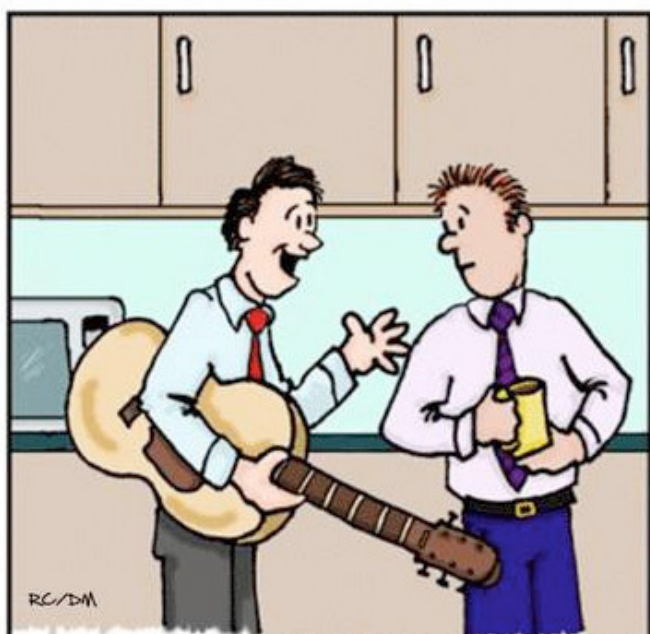
"It's called bluegrass. A friend drug me to something called a 'bluegrass festival', over the weekend and, well, this is pretty much all I'll be doin' for the rest of my life."