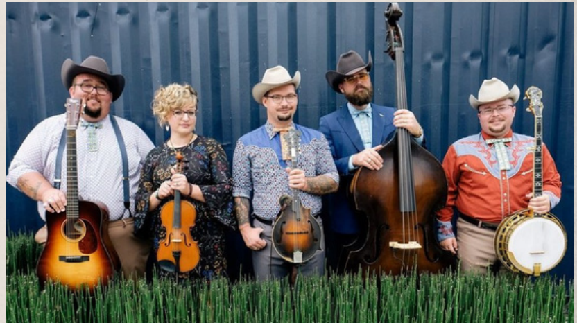
Bowers 2023 Headliners, the Po' Ramblin' Boys