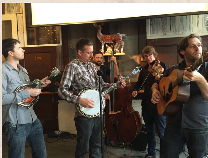
The Bow Ties will headline the Friday Show