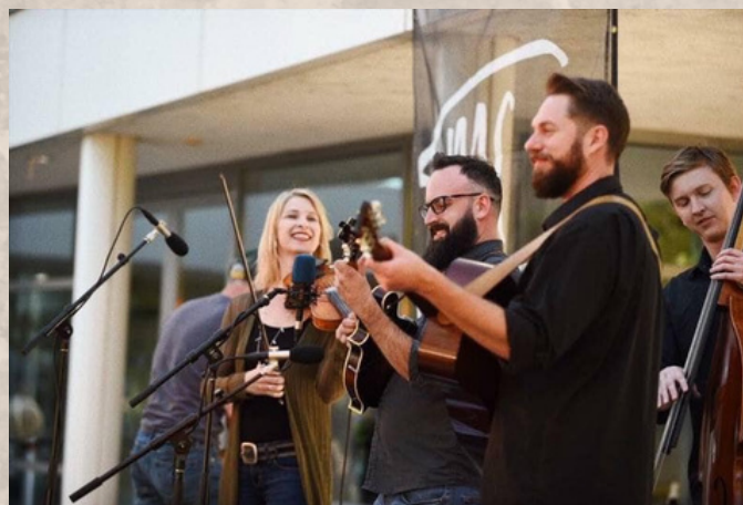
One Button Suit appears on Saturday